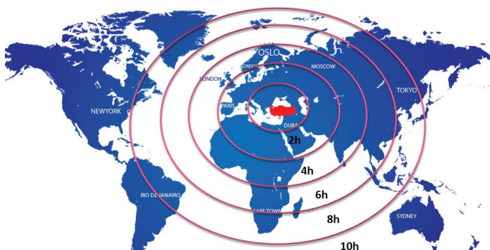
Direct Flights Between 131 Cities & İstanbul